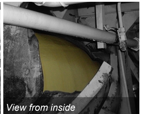
View from inside