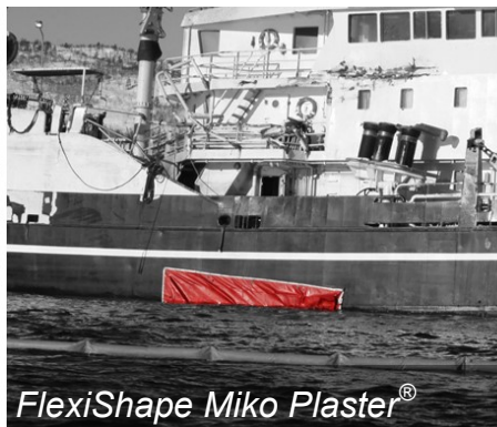
FlexiShape Miko Plaster®